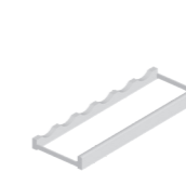
WINE RACK KIT 45 X 570 X 202