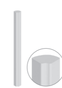
30MM CORNER POST 720 X 30 X 30