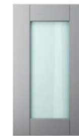
PLAIN FRAME includes clear glass