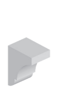
MANTLE CORBAL 166 X 90 X 125 (2NO.)