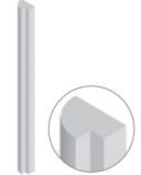
QUADRANT END MOULDING 2450 X 50 X 70