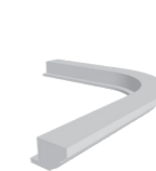
QUADRANT CORNICE 50 X 470 X 470