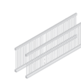
PLATE RACK KIT 310 X 1200 X 24